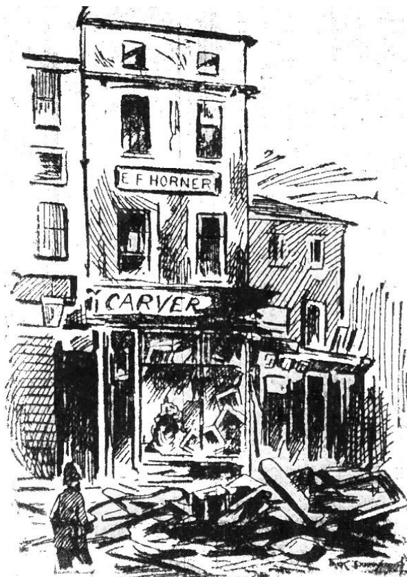
HORNER'S SHOP, ANGEL STREET OPPOSITE MESSRS. HOVEY'S. ALL THE FLOORS BURNT OUT. NOTHING REMAINING BUT WALLS.

Reaching across the roadway, the flames licked the side of the shops extending from Bank street corner to the Angel Hotel, and in the case of premises occupied by Mr. E. F. Horner caused great damage. The roof of Mr. Horner's establishment ignited first, the flames then extending downwards into the upper storey. This room was used for mounting pictures and general decorative work, and contained many valuable engravings and water colours. From there the fire continued descend until it reached the ground floor, destroying everything in its progress. The window was shattered, the contents destroyed, the outside ornaments and signs burnt away, and the structure gutted, fire and water together making a complete wreck of the whole place. Fortunately the fire did not extend in the direction of the rear, the stables and the outbuildings were saved and the horse removed unharmed. But things were quite bad enough as they were; the damage to stock alone amounting to nearly £400. In the window was a valuable picture worth a hundred guineas. This was destroyed. Mr. Horner says he is insured, and thinks his loses will be met. In addition to the damage to stock there is the ruin of the shop, this latter being no inconsiderable item, the place being totally unfitted for anything, and in need of entire reconstruction.