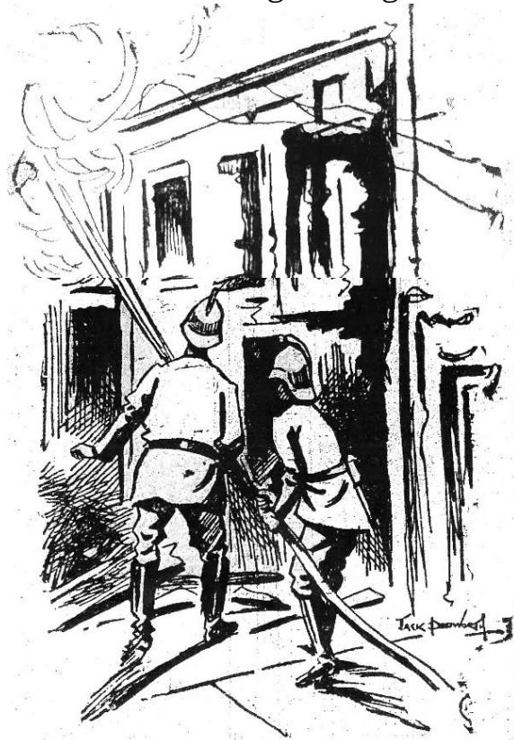
UP TASKER'S PASSAGE. FIREMEN PLAYING ON THE RUINS.

Of the premises on the same side of the thoroughfare as Hovey's, but higher up Angel street, those occupied by Tasker, Sons, and Company suffered most. The shop next to Hovey's is occupied by Fleming, Reid, and Co., generally known as the Greenock Wool Company. This, marvellous to state, escaped intact, the reason probably being that only the rooms fronting to Angel street, are occupied by that firm. Hovey's premises are